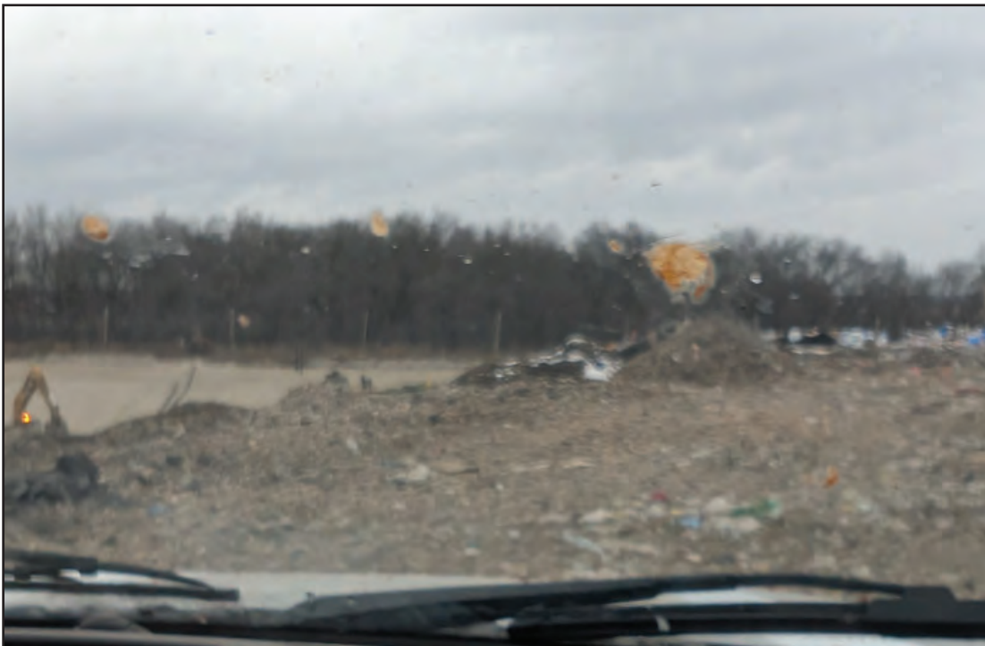
Soils stockpiling for cover placement