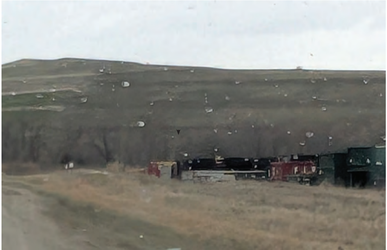
West slope of cap project, vegetation is developing quickly