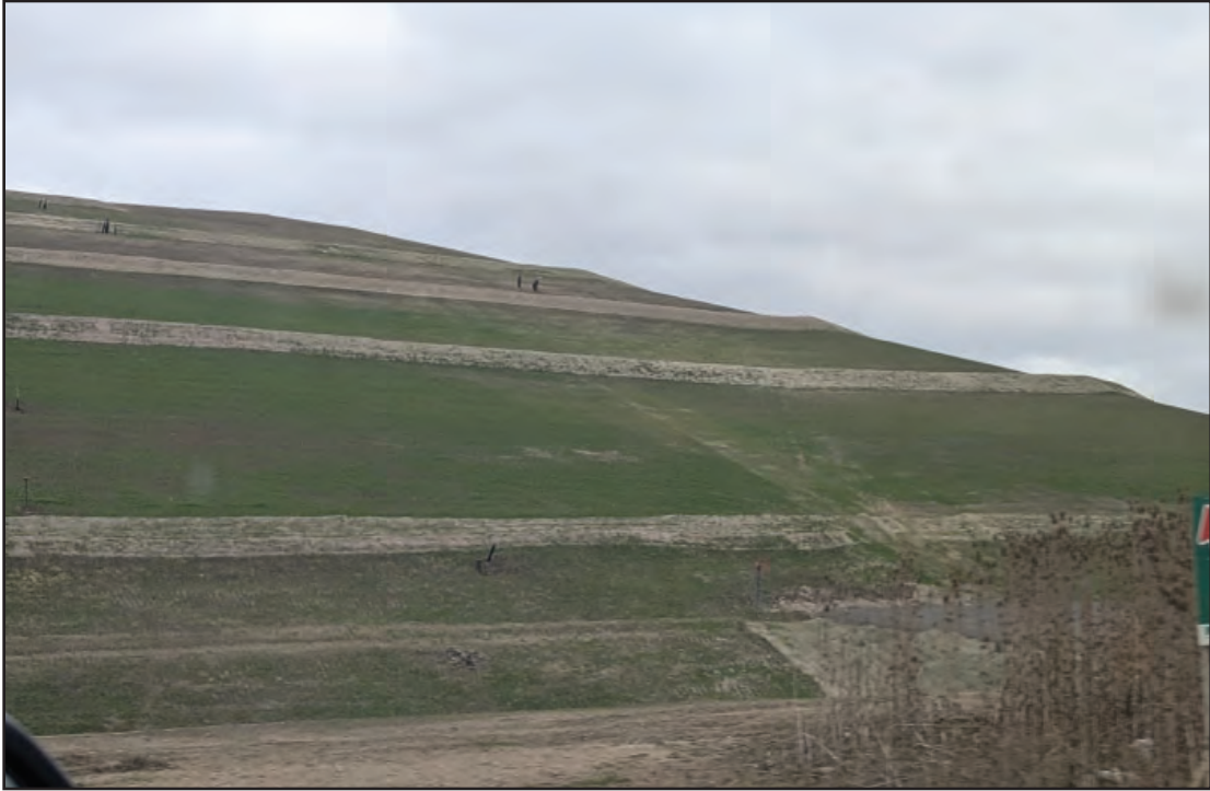
Capped project greening well