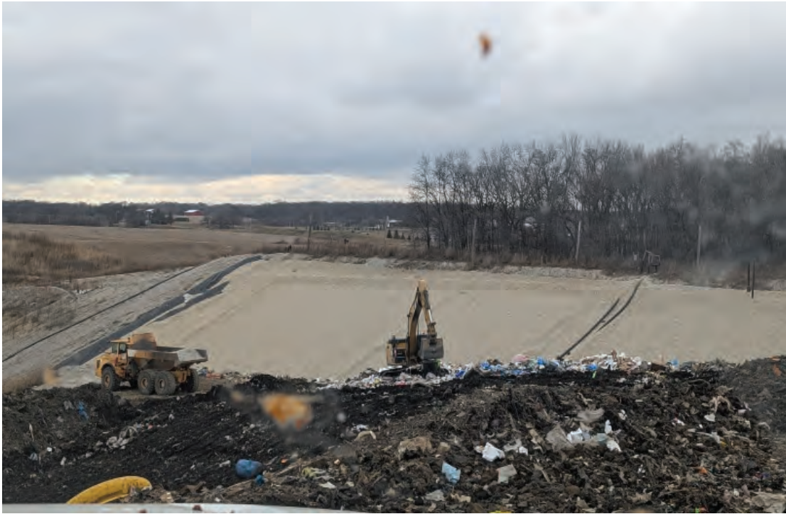
Truck with stone to fill gas well as it is raised