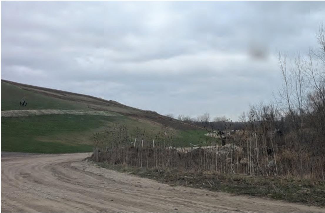
West slope of cap project, vegetation is developing quickly