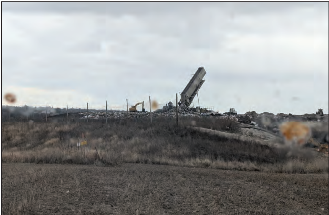
Tipper viewed from the East