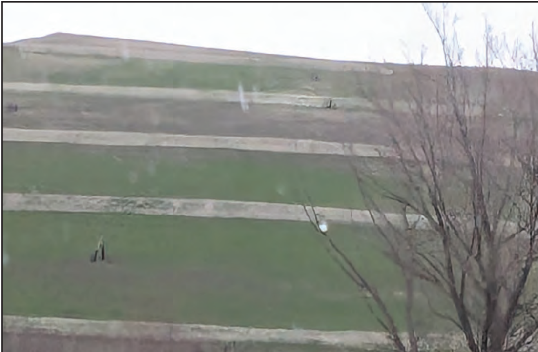
West slope of cap project, vegetation is developing quickly