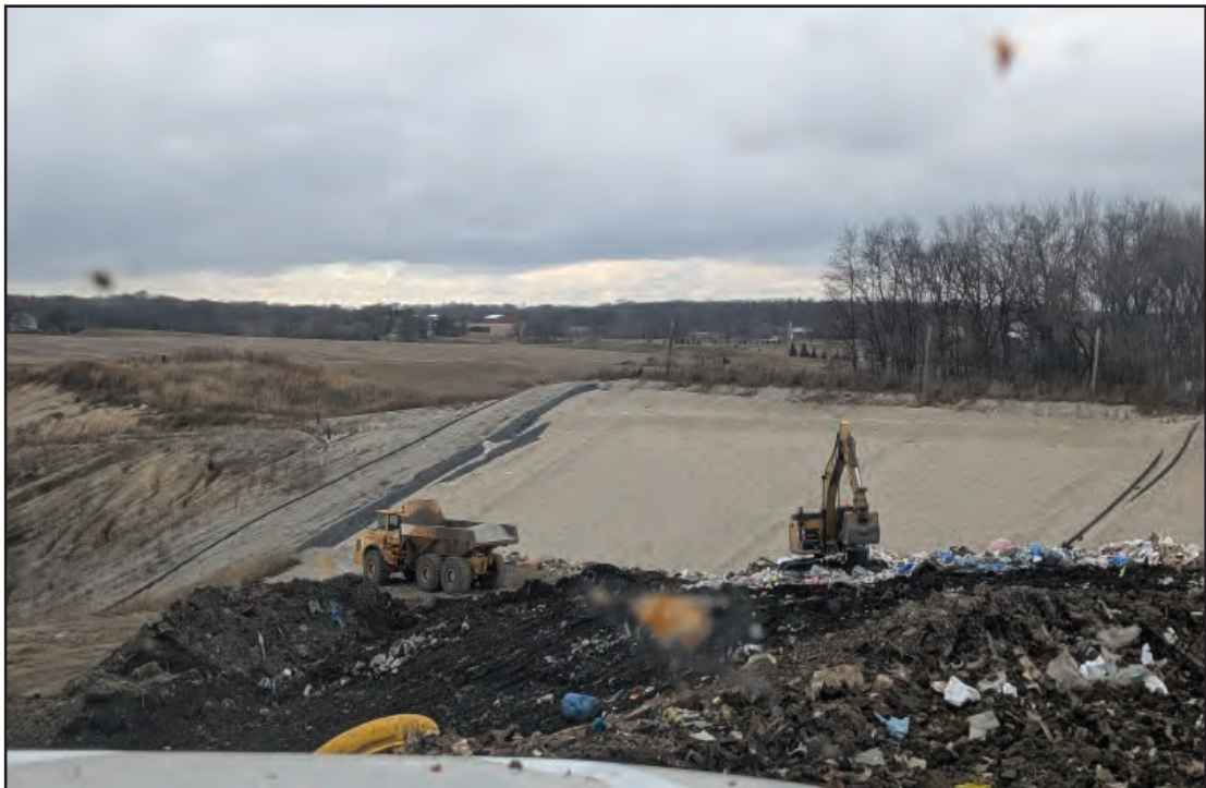
Excavator raising gas well in Northwest corner in Phase4, just above first liftr