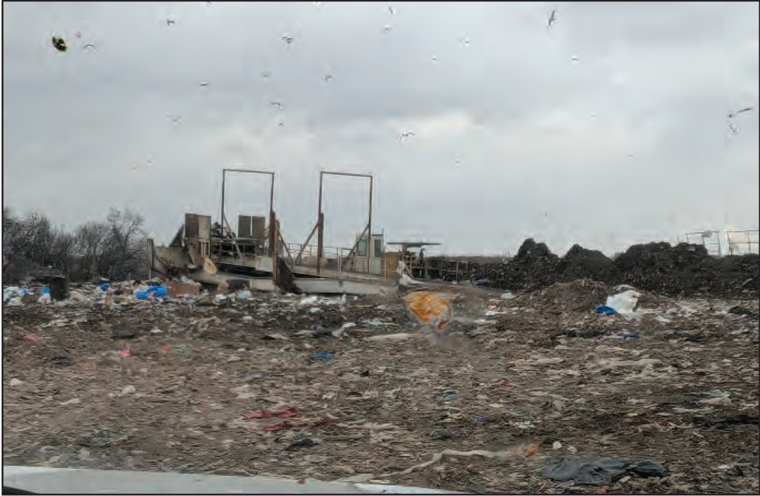
Tipper with stockpiling on East side