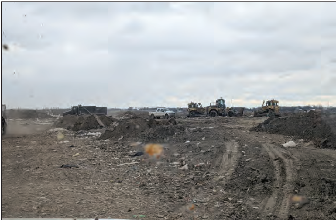
Soils stockpiled in center and Southeast corner of Phase 4