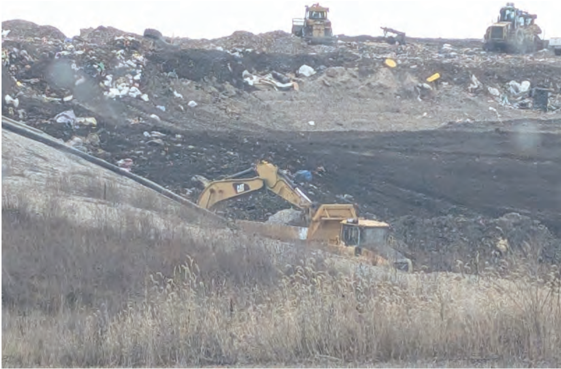
West slopes of Phase 4 above well raising