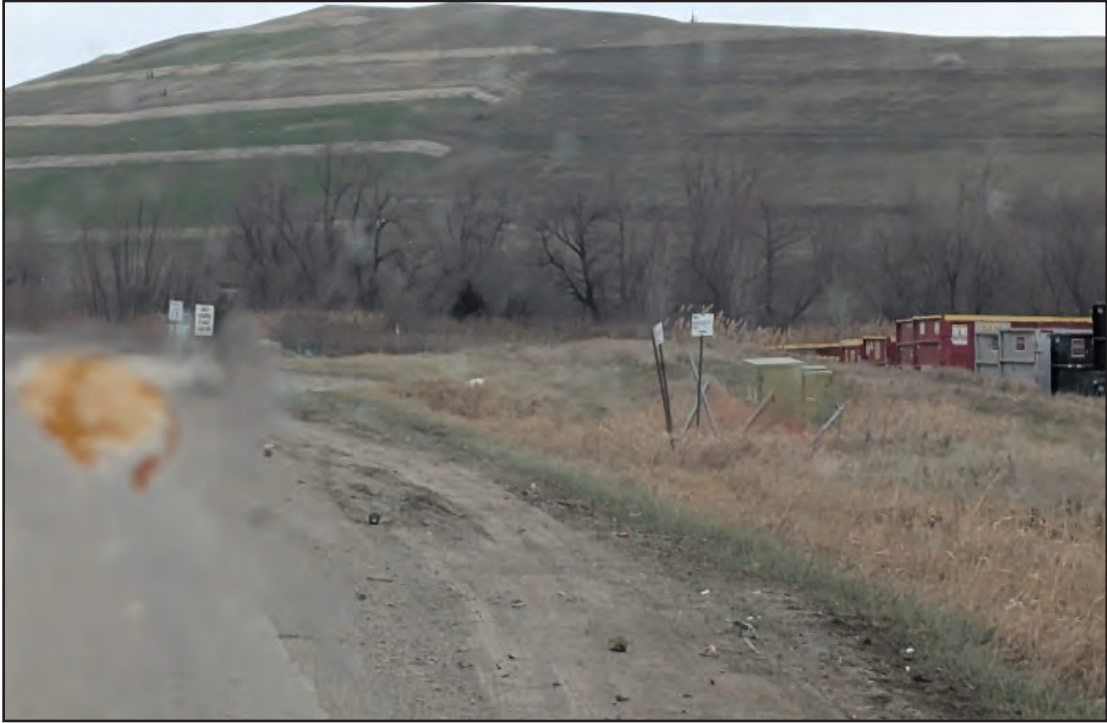
West slope of cap project, vegetation is developing quickly