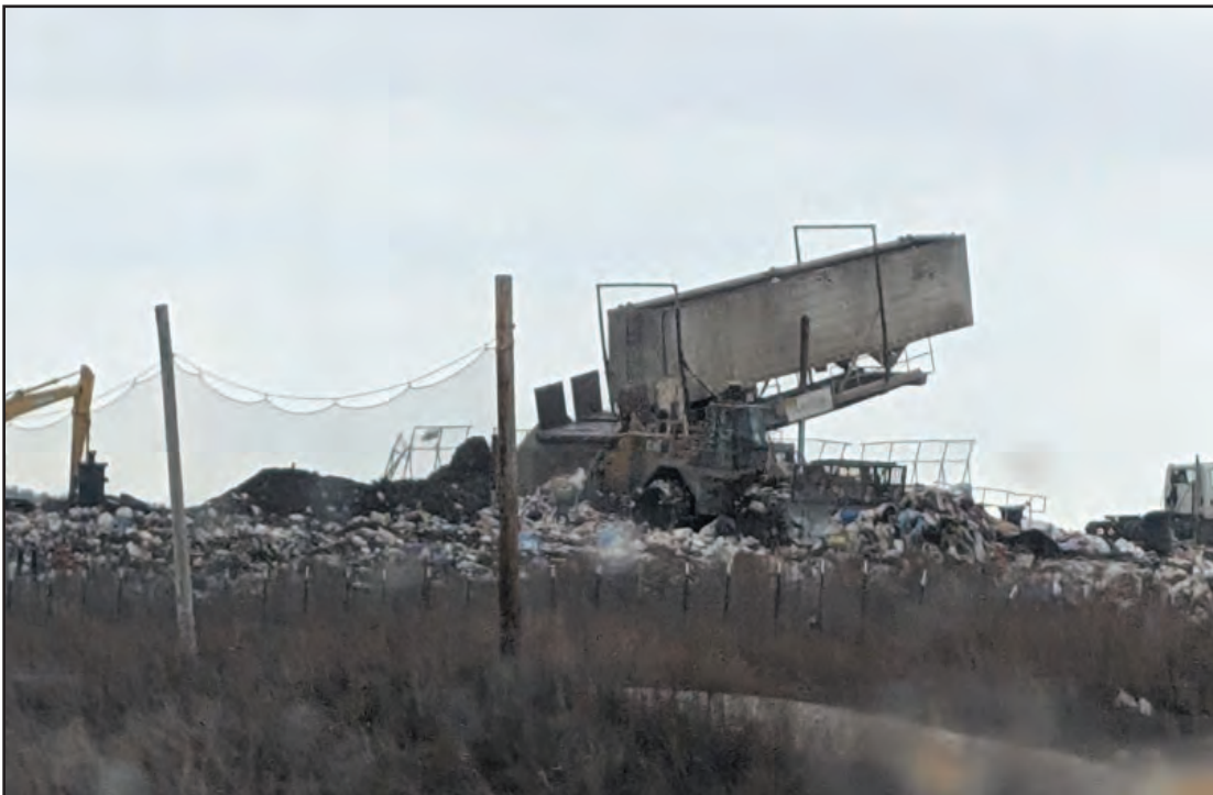
Tipper viewed from backside