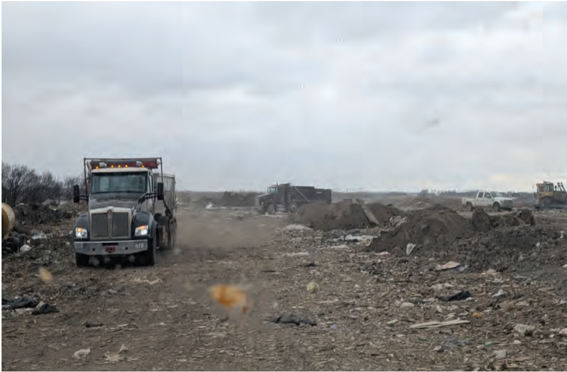
Soils stockpiled in center and Southeast corner of Phase 4