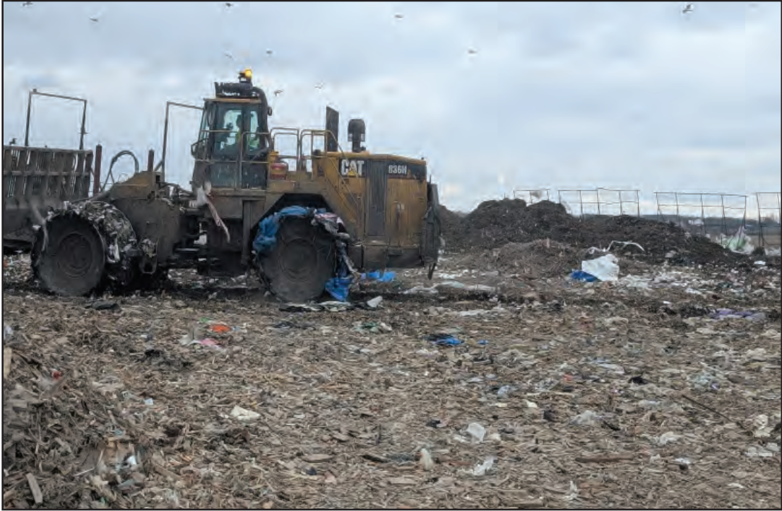
Travelway covered in wood waste to improve access