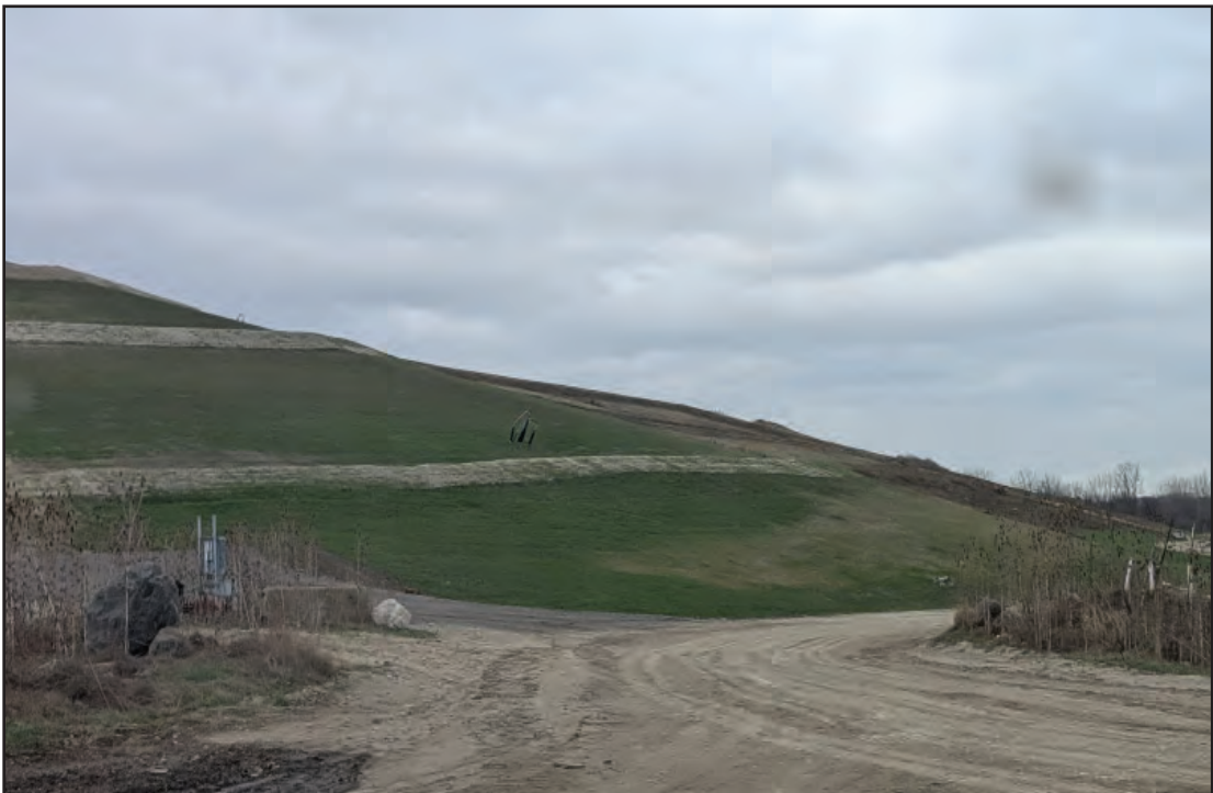
West slope of cap project, vegetation is developing quickly