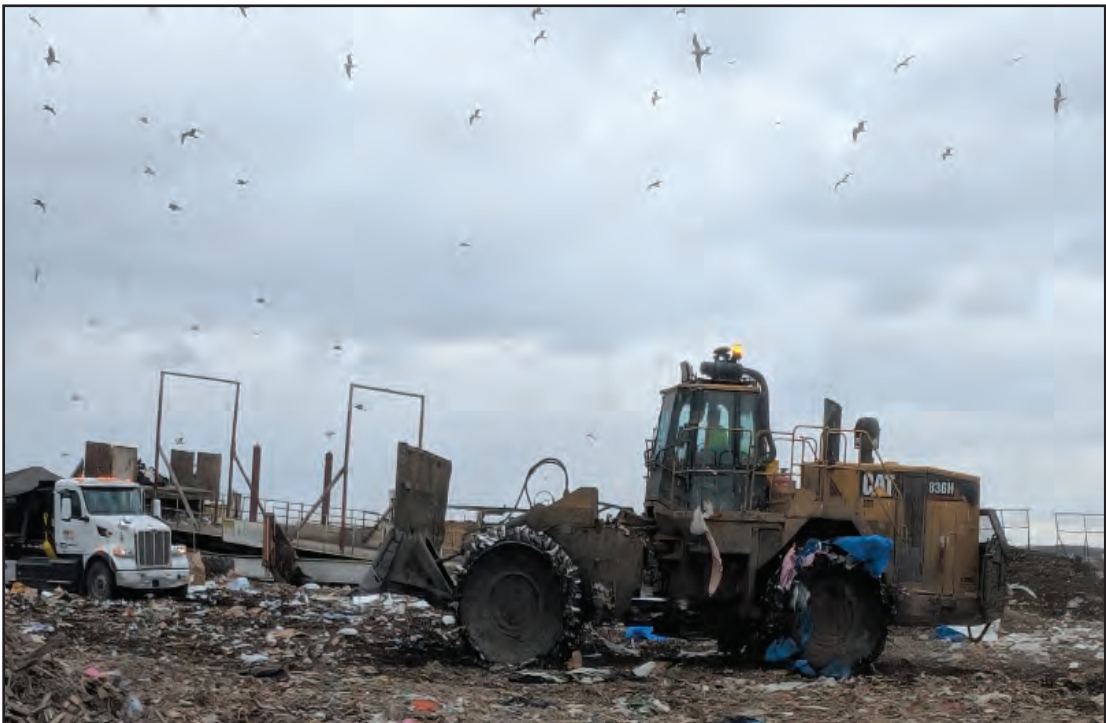
Compactor returning to clear tipper